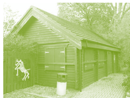
Natural History Cabin.