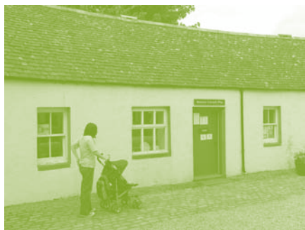
Craft Shop (Balance Crystals).