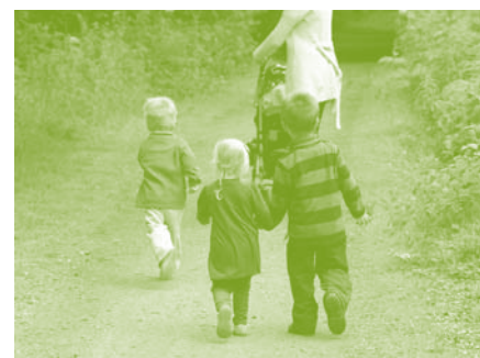
Aden Country Park.