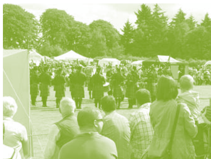
Pipe Band Competition.