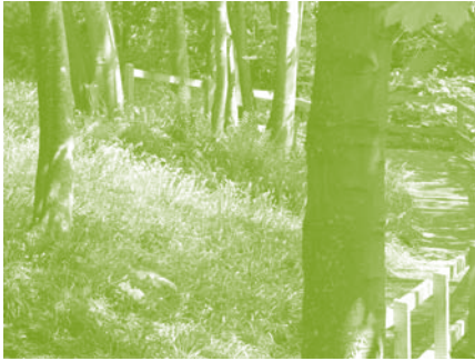
Aden Country Park.