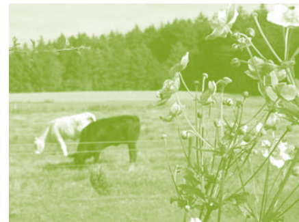
Aden Country Park.

E1 Partnership Working To work together with our Community Planning Partners to ensure we share resources, skills and experience to support ongoing activities, resulting in a positive impact on the communities within the Buchan area.