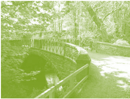
Aden Country Park.