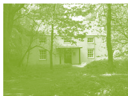
North East Folklore Archive.