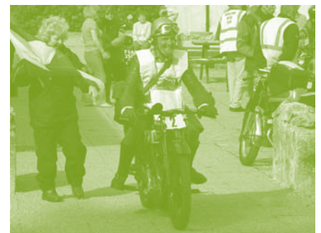
Vintage Motorcycle Event.