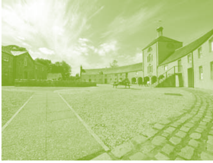
Aberdeenshire Farming Museum.