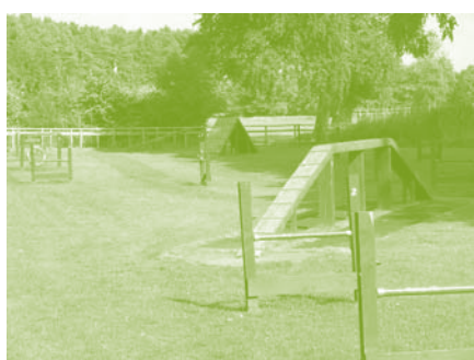
Dog Agility Area.