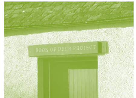
Book of Deer.

Over the last 18 months, events have been organised and actively promoted. As a result visitor numbers have significantly increased.