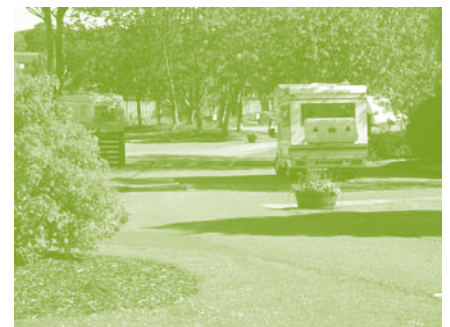
Caravan and Camping Site.