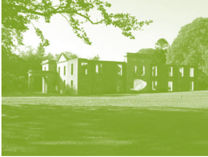
Aden Mansion House.