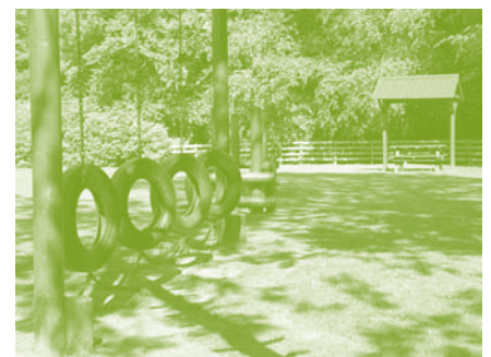
Childrens Play Area.