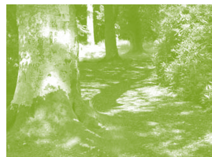
Aden Country Park.