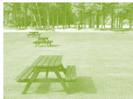
Picnic and BBQ Area.