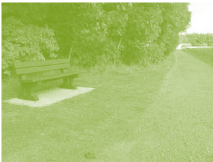
Aden Country Park.