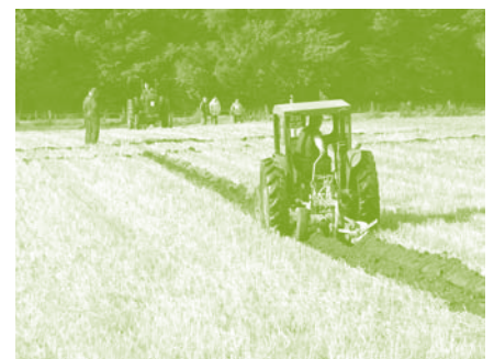
Vintage Tractor Day.