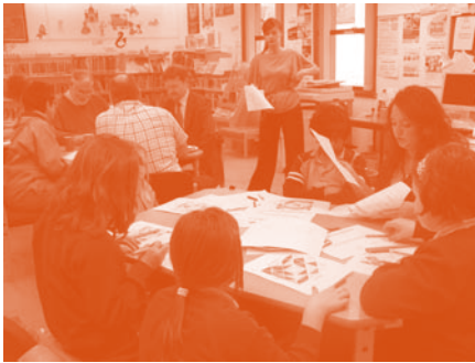
Community Signature Event at the Library.