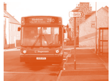
Service bus in Boddam.