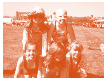
Gala Day Fun.

There was also a call for more activities for older people – it was felt that some follow up consultation work was needed to ascertain the demand for the different ideas coming forward (outdoor bowls, IT classes etc).