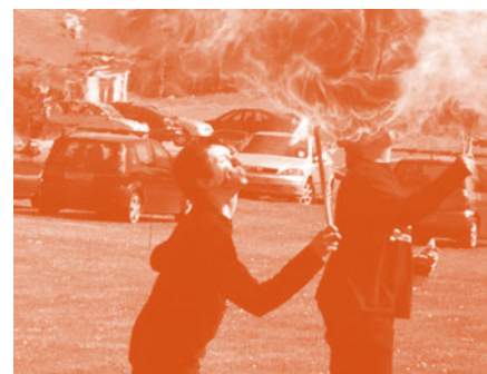
Theatre MODO in Boddam.