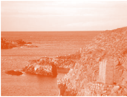
Cliffs at Boddam.