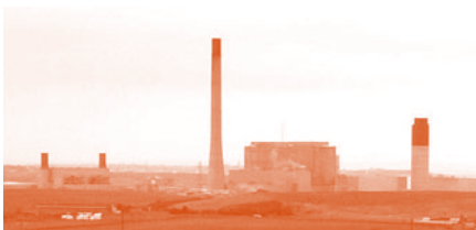
The Power Station.