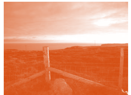
View from Stirlinghill.