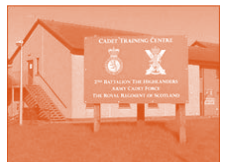
Cadet Training Centre.