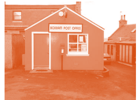
The Post Office.