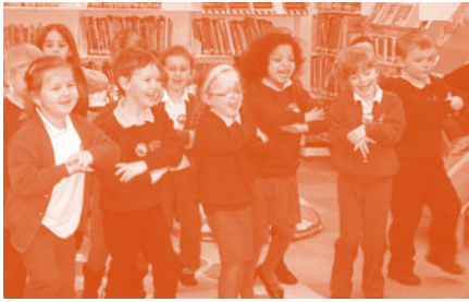
Fun activities in the Library.