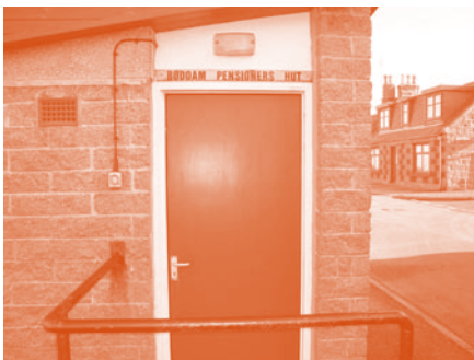
The Pensioners' Hut.