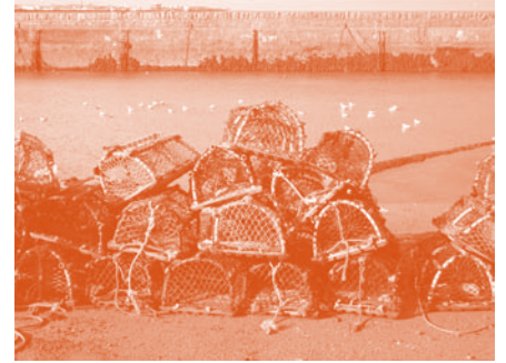
Creels at the Harbour.