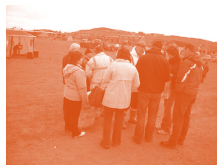
Looking over to Stirling Village from the Recreation Park.