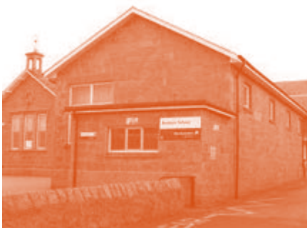
Boddam Primary School.