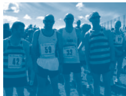
Fun at Fishie Gala.