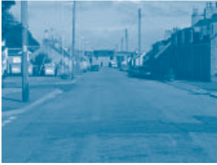
Overhead lines in the Main Street.