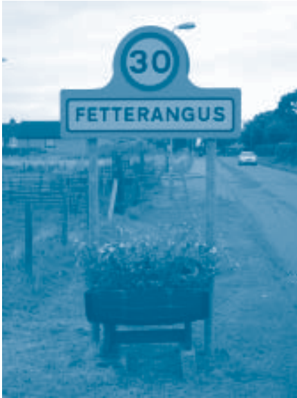
Entrance to Fetterangus.