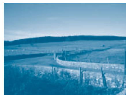
View towards The Forest of Deer.