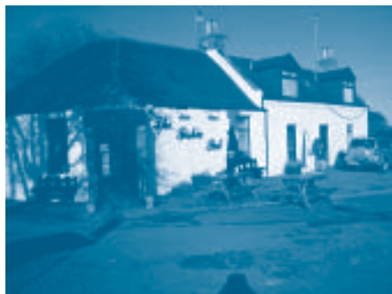
The Fishie Pub.