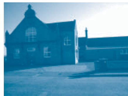
The Chalmers Institute.

Following the undertaking of a successful technical feasibility in Phase I, the Community Association established a