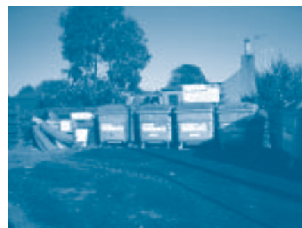
Recycling Bins by the Square.