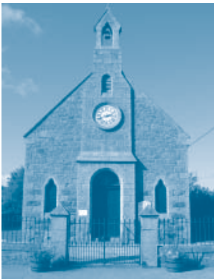
The Parish Church.