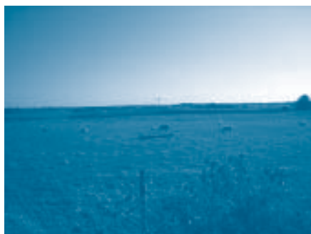
Countryside around Fetterangus.

separate organisation PUFF Power to drive forward Phase 2 & 3 of this project which includes the installation of a wind turbine to the National Grid and a Resource Centre in the village hall which will give working examples of different renewable energy sources. The income received from the Wind Turbine will be used to make village improvements including to the hall, as well as providing a Grant Scheme which community groups will be able to apply for. It is anticipated that the Renewable Resource Centre will become a focal point for people interested in sourcing the best type of renewable energy for their personal requirements, thereby putting Fetterangus on the map as a centre for renewable excellence.