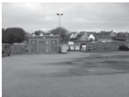
Car Park outside Public Hall.