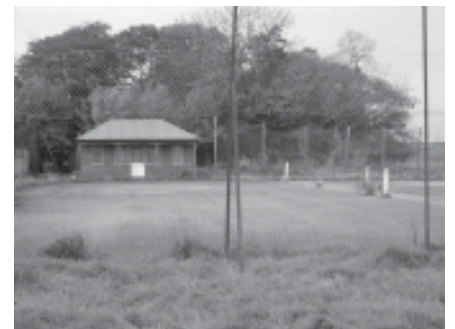
Old tennis courts.