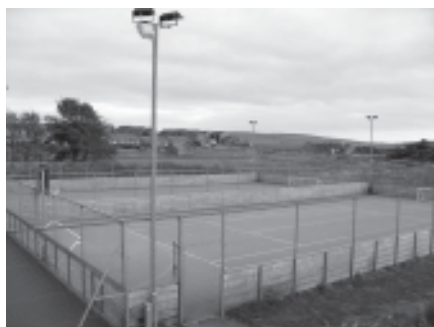
All weather pitches.