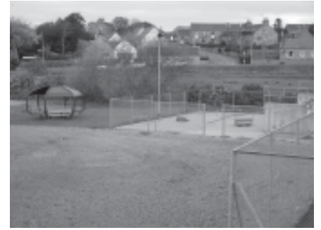
Youth shelter and skatepark.