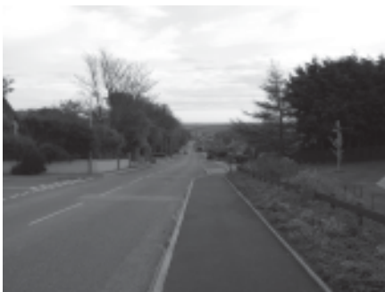
View down Main Street towards the village.