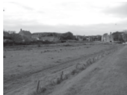
Field below Park View.

Many other suggestions received support and these are listed on pages 6 - 9. A summarised Action Plan can be found on pages 10 and 11.