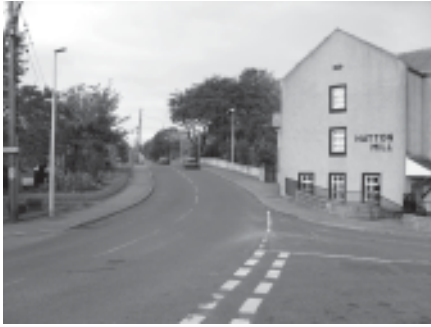
Junction at Hatton Mill.