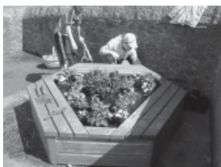
Planting out summer bedding.