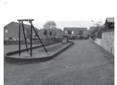
Play Area at Quarry Road.