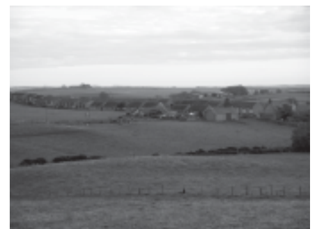
View of village.