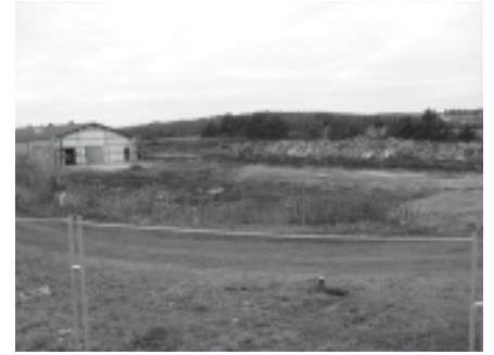
Old station yard.