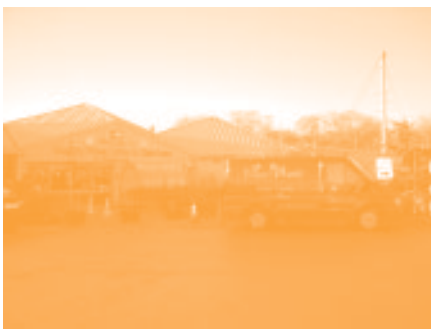
Happy Plant Garden Centre.