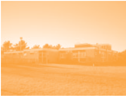
Pitfour Primary School.