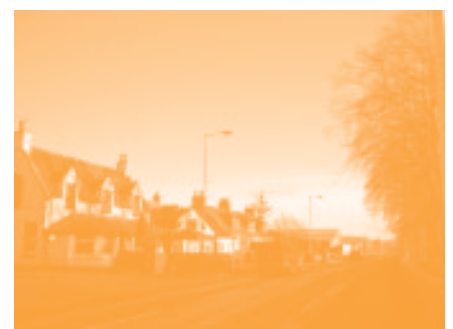
View from Mintlaw Station.