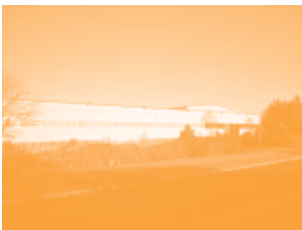
The Fish Factory.