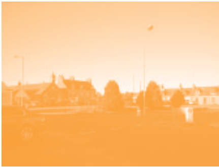
View of Square showing Public Hall.