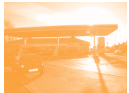
Filling Station and Convenience Store.