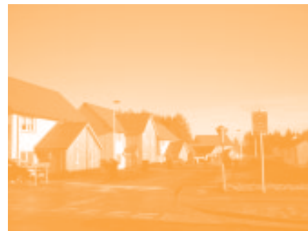
New housing, Sutherland Close.