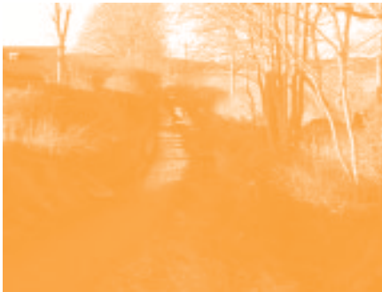
Formartine and Buchan Way.