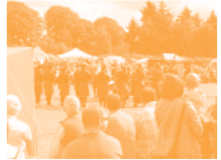
Aden Country Park.