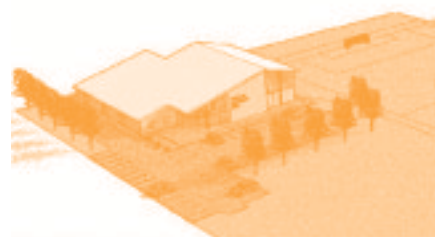
Proposed new Community Facility.

Many other suggestions received support and these are listed on pages 6 - 9. A summarised Action Plan can be found on pages 10 and 11.