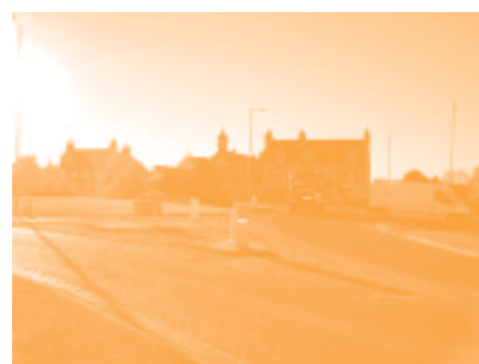
Traffic manouvers on the roundabout.