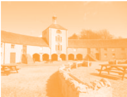
Aden Country Park.