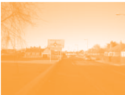
View west towards The Square.