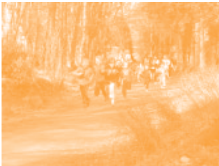
Aden Country Park - MACBI Fun Run.