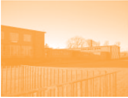
Mintlaw Primary School.