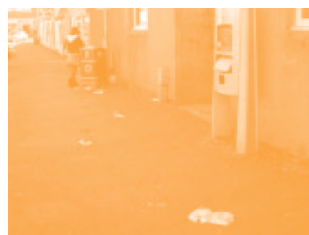
Litter at the Square.