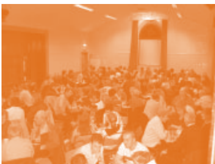
The annual Community Quiz Night - teams representing community groups in the village compete for the Chapman Rose Bowl.