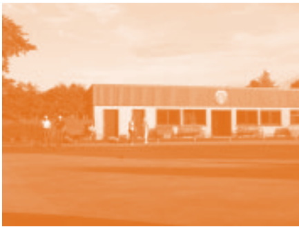
New Deer outdoor bowlers in action.