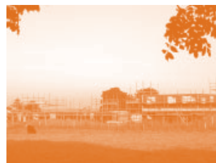
New housing development at Fordyce Park.