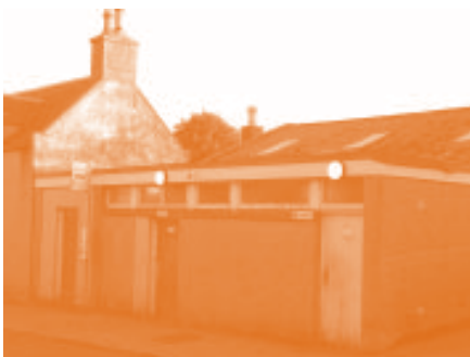
The Public Toilets on Main Street.