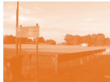
New Deer Pleasure Park.

The provision of footpaths attracted comments across several themes. The most popular request was for a footpath from Fordyce Terrace in the village out to South Culsh Road. (or ideally all the way to Maud to link with the Formartine and Buchan Way).