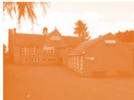
New Deer Primary School.