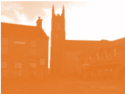
New Deer Public Hall, St Kane's Church and Church Centre.