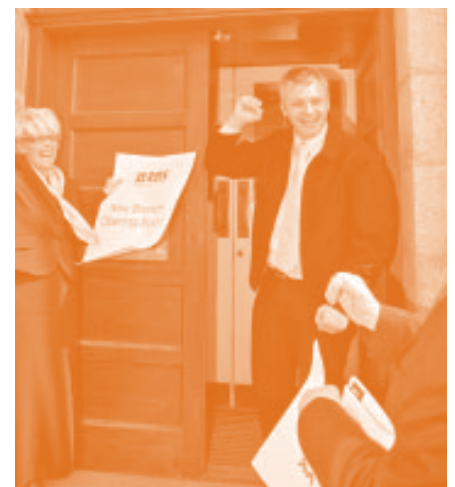
Celebrations as the bank opens.