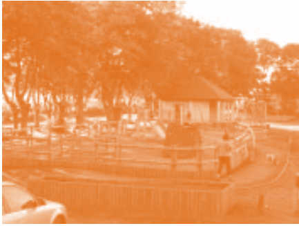
New play areas in the Pleasure Park.