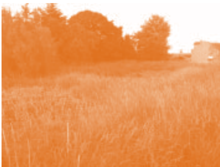
The Dam - Auchreddie Road.