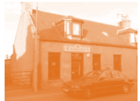
The Kilt Shop.