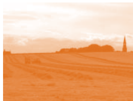
A view up to Culsh Monument.