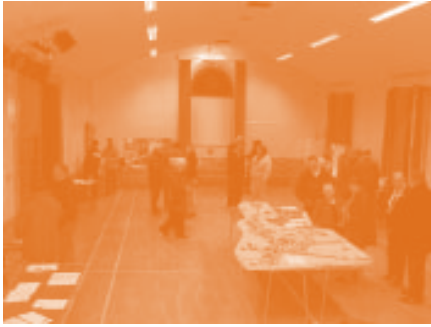
New Deer Planning for Real® Review 2007.