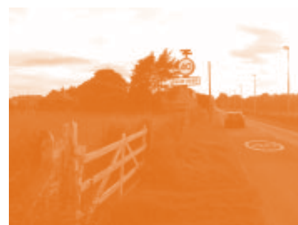
40mph - Auchreddie Road.