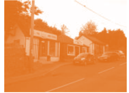
Shops on the Brae.