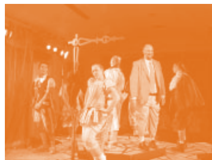
A visiting theatre company perform in the Public Hall.