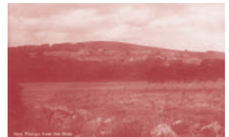
View of New Pitsligo.