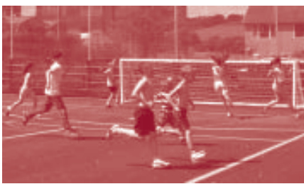
Children enjoying Multi-Use Games Area (MUGA).