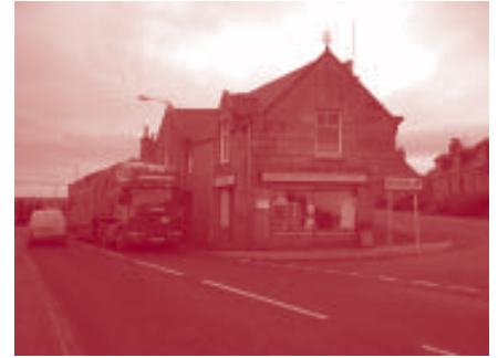
Traffic in High Street.

The community aims to work with funding providers to improve this facility for the benefit of the community.