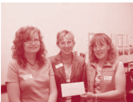
Community Newsletter group receiving funding award.