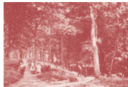
The Den in times gone by.