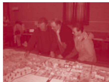
Residents at Planning for Real®.