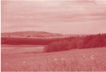
Countryside new New Pitsligo.