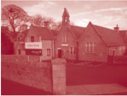
St John's Centre.