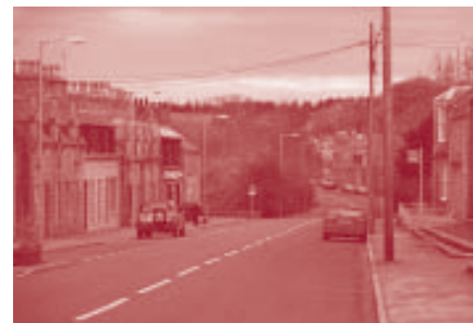
View to Den Bridge.