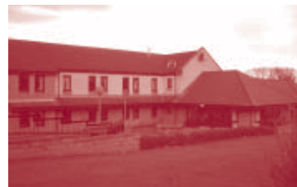
Forbes Court Sheltered Housing.