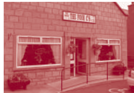
Four C's Cafe.