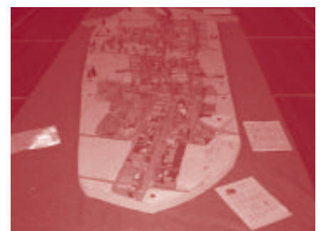
Planning for Real® model.