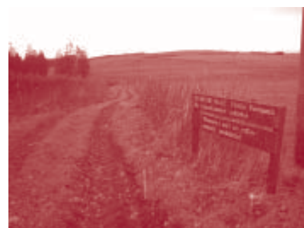
A nearby country walk.