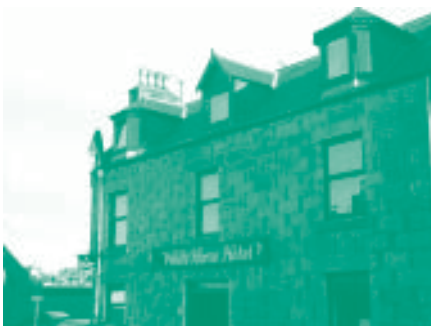
The White Horse Hotel.