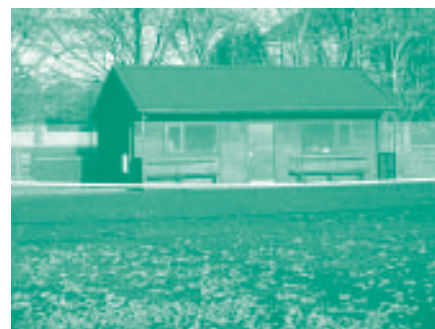
Tennis Courts and Pavilion.