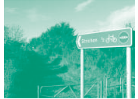
The Formartine and Buchan Way.