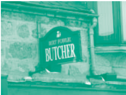
The Butcher's Shop.