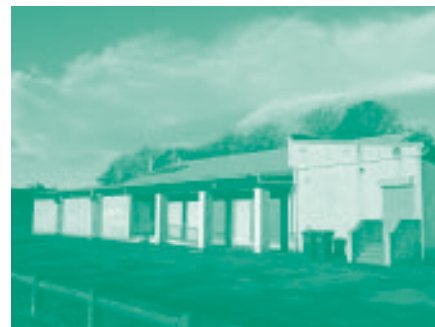
The Ritchie Hall.

Many other suggestions received support and these are listed on pages 6 - 9. A summarised Action Plan can be found on pages 10 and 11.