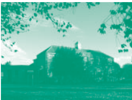
Strichen Primary School.