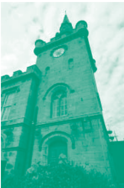
Strichen Town House.