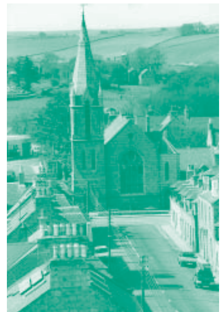
Church from High Street.