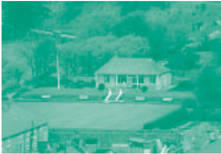
The Bowling Club.