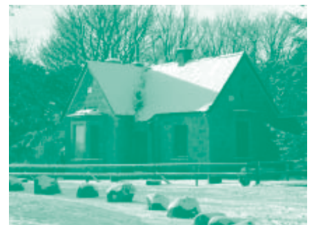
The Lodge at the Lake.