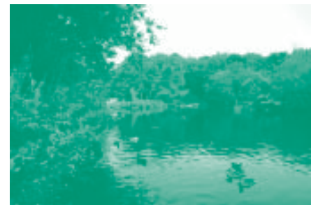
Strichen Community Park - The Lake.