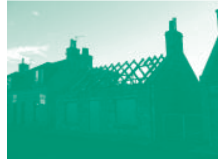
House on Bridge Street.