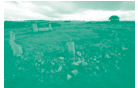
The Stone Circle.