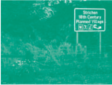
Entrance to Strichen.